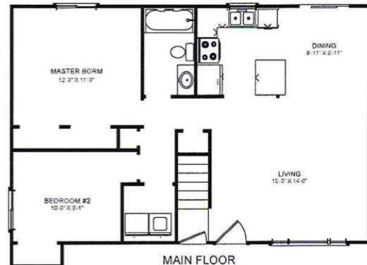
MAIN FLOOR LAUNDRY OPTION

Builder's floor plans may be drawn to show popular exterior design and interior floor-plan options that are not included in the standard home design and pricing. Please consult with the Preferred Properties' agent in each community with any questions about what optional features are shown and the cost.