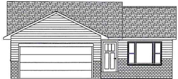
OPTIONAL ELEVATION "B"