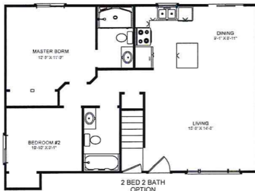
2 BED 2 BATH OPTION